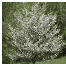
Hawthorn- Crataegus viridis 'Winter King'

'30' tall, white flowers. Fruit attracts wildlife.