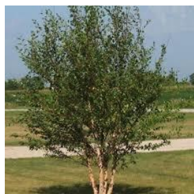
River Birch- Betula nivea

55' tall, attractive curling bark. Flowers attract humming birds