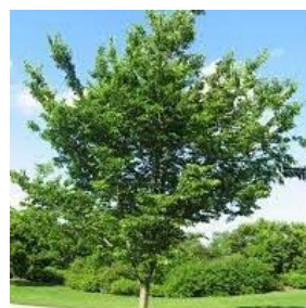
Hackberry- Celtis occidentalis

55' tall, attractive curling bark. Flowers attract humming birds