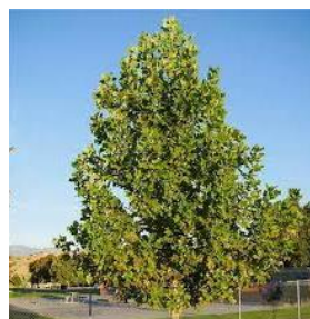
Tulip Poplar- Liriodendron tulipifera .

40' tall, white flowers, fall color. Attracts wildlife.