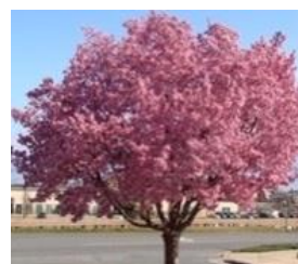
Okame Cherry- Prunus X 'Okame'

40' tall, fall color. Fruit attracts birds.