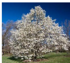
Cherokee Princess Dogwood- Cornus florida

40' tall, fragrant flowers attract pollinators.