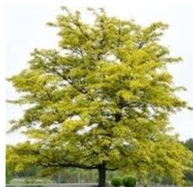
Honeylocust- Gleditsia triacanthos 'Skyline'

30' tall, white flowers, red fruit. Attracts butterflies.