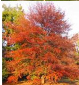
Black Gum- Nyssa sylvatica

80' tall. Flowers & seeds attract wildlife.