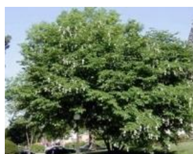
Yellowwood- Cladrastis kentukea .

40' tall, fragrant flowers attract pollinators.